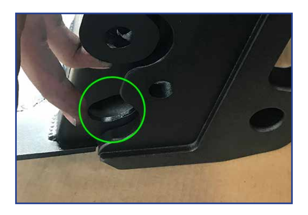
Align bumper and side wings and fully tighten.