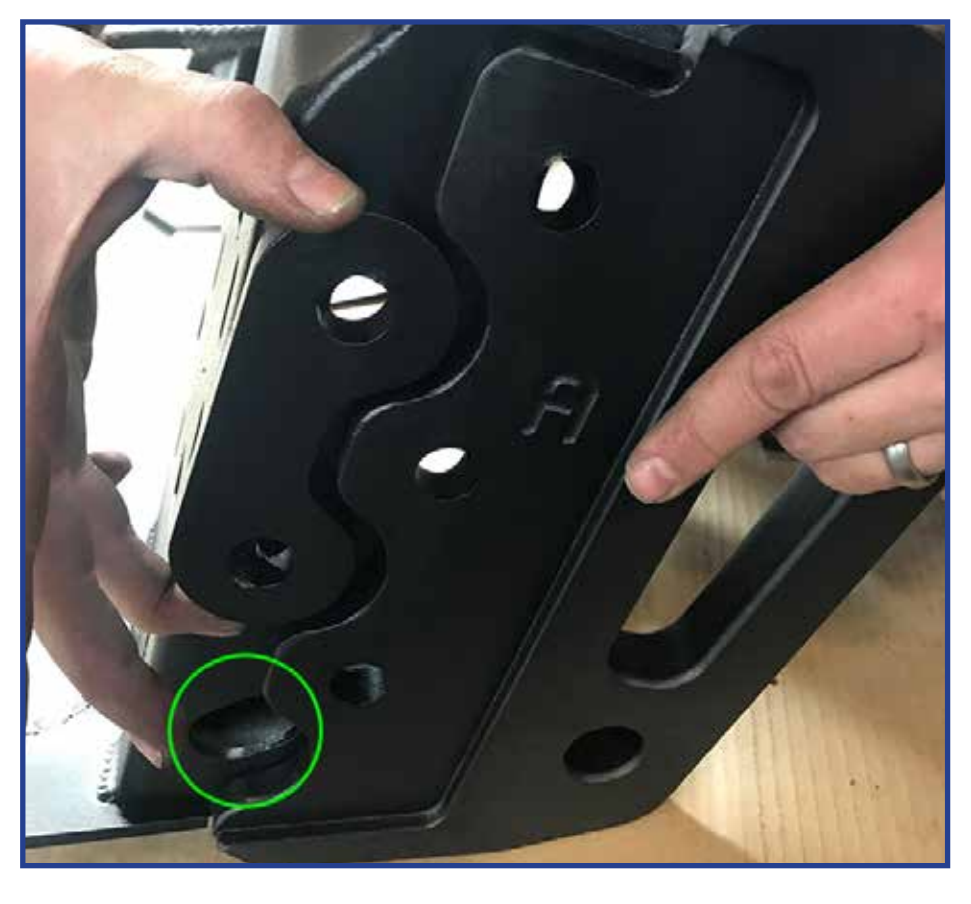
Instert 9/16 - 2" Bolts with washers on either side and loosely tighten for both side wings.