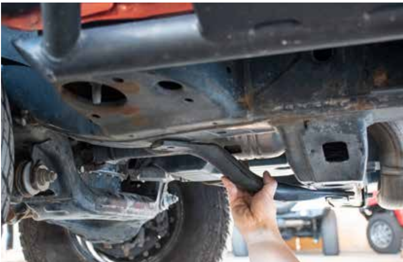
The curved bars shown left will also need to be removed with two bolts holding each one.