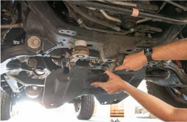
Mid section stock skid plate being removed.