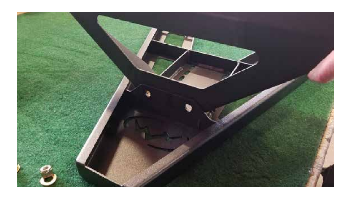
Attach 1/2" Bolts, washers and nuts as shown in photo.

Place Bottom support into position as shown below.