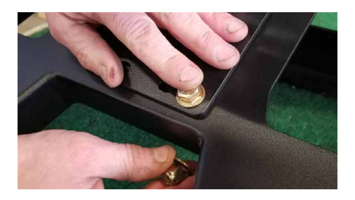
Tighten down all bolts with 9/16" socket wrench

Secure with provided 3/8" bolts, washers and nuts