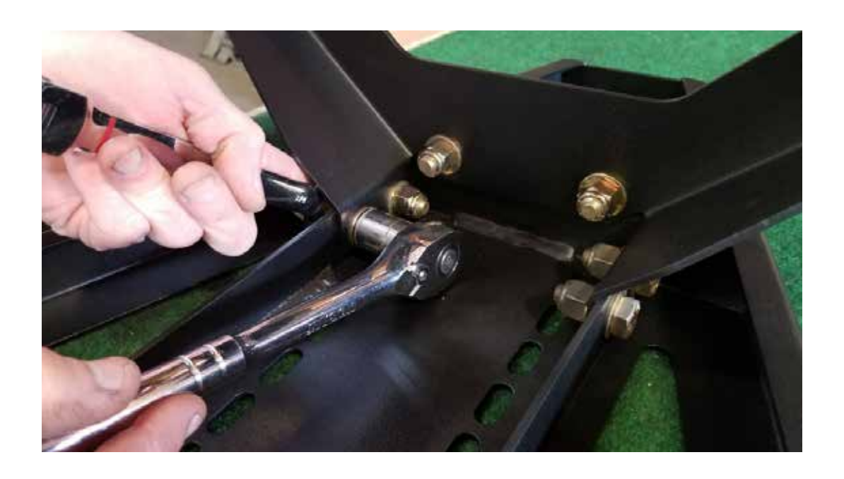
Attach tire mount bracket to desired position on front of mount

Begin tightening all bolts shown in photo below.