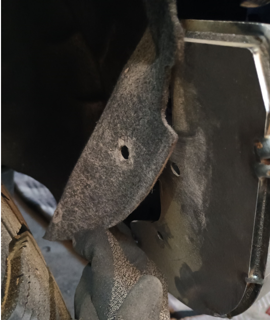
SECURE WHEEL LINER TO INSIDE