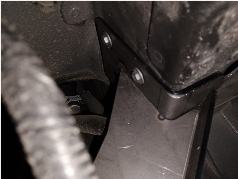
2 x OEM FRAME HARDWARE

Attach the mounts to the frame and bumper location as shown. Mount using OEM and provided hardware. Leave hardware loose for adjustment before tightening.