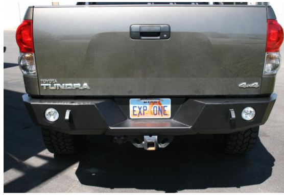
2007 Tundra Rear Bumper